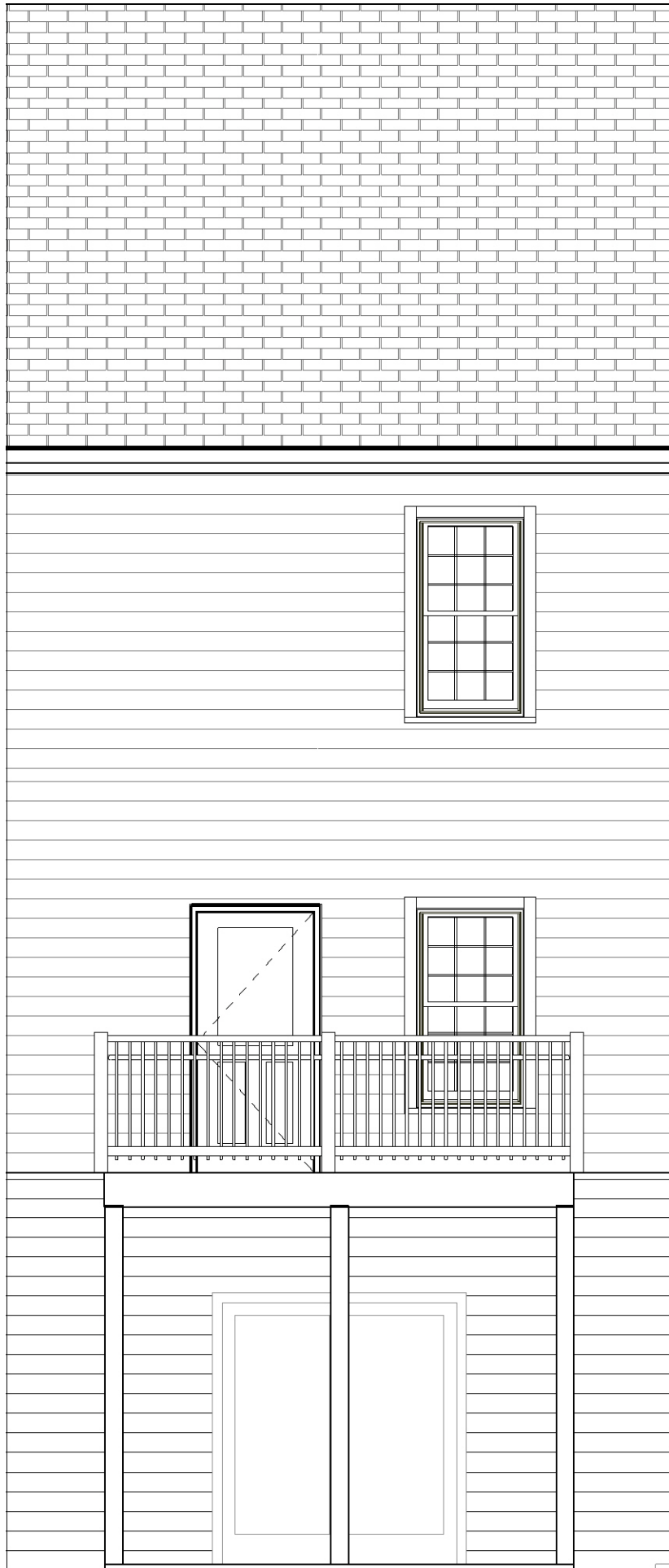
*REAR ELEVATION (EDINBURGH)